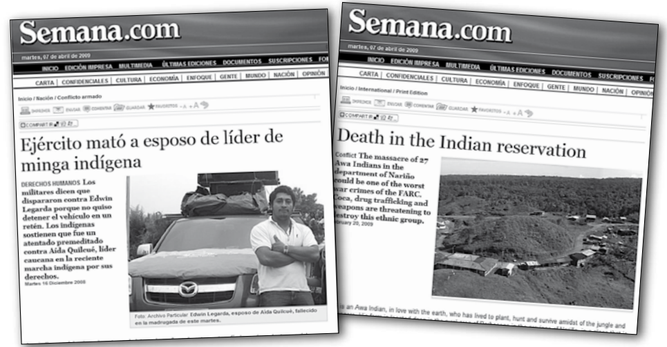
«All of the armed actors use strategies to involve the civilian population in the armed conflict».

LFA: The Nasa, Kankuamo, Embera, Wiwa and Awa Peoples are the five nations who are most seriously affected by socio-political violence. There are also others who are at risk of physical and cultural disappearance, such as the