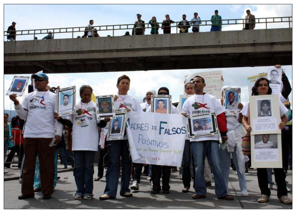
Family members of the victims of "false positives" demand justice, during a demonstration on 6 March 2009

The hostages were released in the midst of the pre-electoral atmosphere which is beginning to take hold of Colombia as the country prepares for the next presidential elections, and also in the light of several new scandals. New witness statements were reported in the media on the issue of "false positives", including a «man who handed over young people from Soacha to members of the Army. These young people were later murdered and presented as having died in combat». One of the investigators of the "false positives" committed in Ocaña told the news magazine Semana that «we have