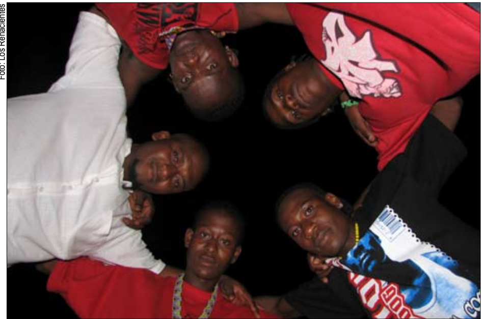
Los Renacientes, «we are messengers of the suffering which other communities also live through».

LR: In our country security is not guaranteed for groups who play this kind of music, for those who claim their rights. This has meant that the opportunity to share our music locally has been taken away from us, and that we