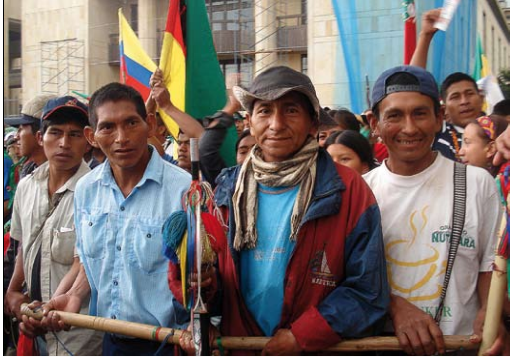
In 2008 the Minga, demanded that the State comply with agreements it has not fulfilled.

«La Configuración de un Genocidio Silencioso» ONIC, 2 November 2008