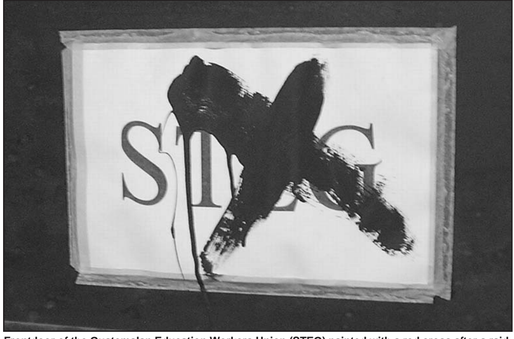
Frontdoor of the Guatemalan Education Workers Union (STEG) painted with a red cross after a raid. June 2005.

On the night of 7th to 8th of May the head office of the National Coordinating body of Campesino Organisations (CNOC) which is also used as the coordinating centre for the Indigenous, Campesino, Trade Union and Popular Movement (MICSP) was raided and all their computers containing valuable information regarding strategic and operational plans, reports of activities and a database of both organisations were taken.