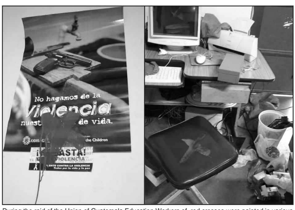
During the raid of the Union of Guatemala Education Workers of, red crosses were painted in various parts of the office.

According to the Unit for the Protection of Human Rights Defenders of the National Human Rights Movement the objective of these raids is to obtain information and in this way gain control of the networks of political, financial and operative support of the organizations and, such as in the case of CNOC, to find out the state of their accounts and locate weaknesses./3 The Unit goes on to state that this type of raid - robbery of information - does not represent a new trend for the social movement but what does represent a new trend is the raids in which no information is stolen but evidence of forced entry and a serious of messages are left, such as in the case of the house of Byron Garoz y Cristina Buczco, are left. In all cases the social movement has denounced the attacks as a "systematic attempt to generate fear and demobilise