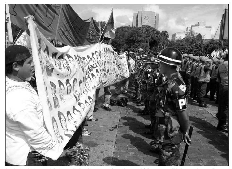
Civil Society activists and the Army during the actividades on National Army Day 30th of June 2005.

In mid - 2000, PBI began receiving a number of requests for international accompaniment. As a result, an investigation was carried out in the field which revealed a deterioration and in some cases a closing of the space for human rights defenders. In April of 2002, PBI decided to reopen the Guatemala Project to carry out international accompaniment and observation in coordination with other international accompaniment NGOs. The new PIB office was opened in April 2003.