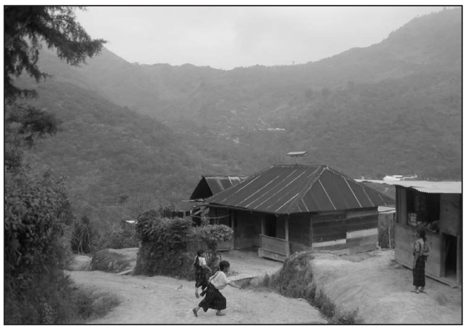
llom, Municipality of Chajul, Quiché one of the areas most affected by conflict over land ownership.