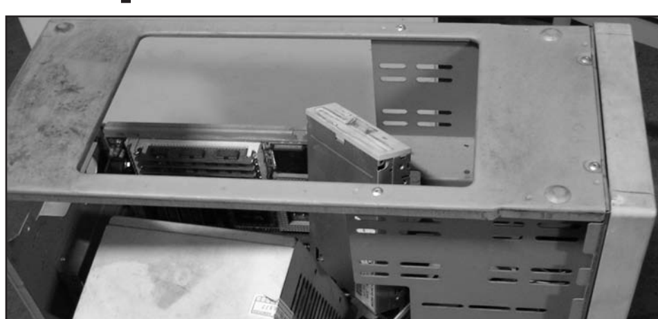
Often only the hard drive is stolen from the computers during a raid, as above in the STEG office.

On 27th of June the social movement sent another letter to Vice President Stein to bring to his attention the fact that by that date no action had been taken to fulfil these promises. The Vice President responded the following day with a letter reiterating the Government's repudiation of the "threats against activists and attacks on some of the offices of human rights organizations" and its availiability to continue to "strengthen permanent communication.../in any situation in which they find the human rights work they (sic) carry out threatened"/6 The letter links some of the attacks mentioned by the social movement to common crime and promises to continue strenghtening "special