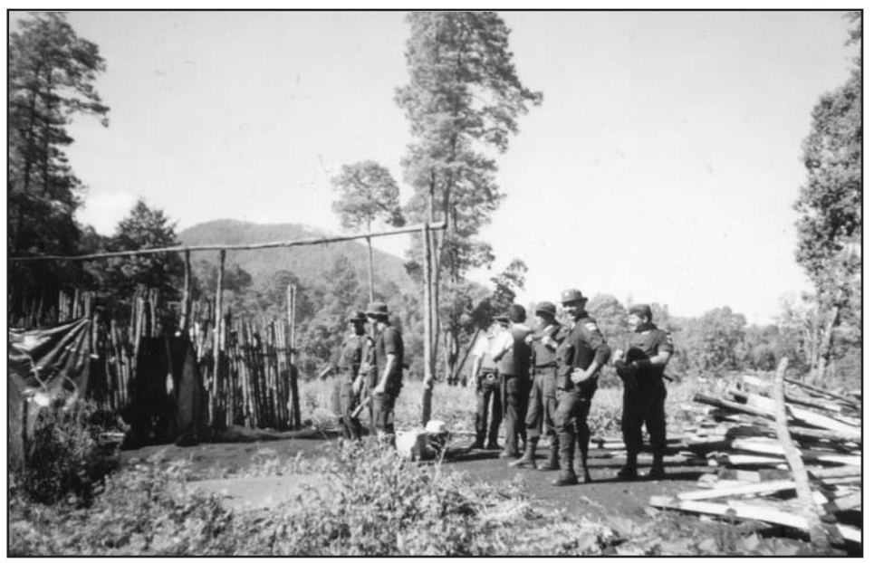
Police evict the community of Santa Ines, Alta Verapaz, 8th of July 2005.