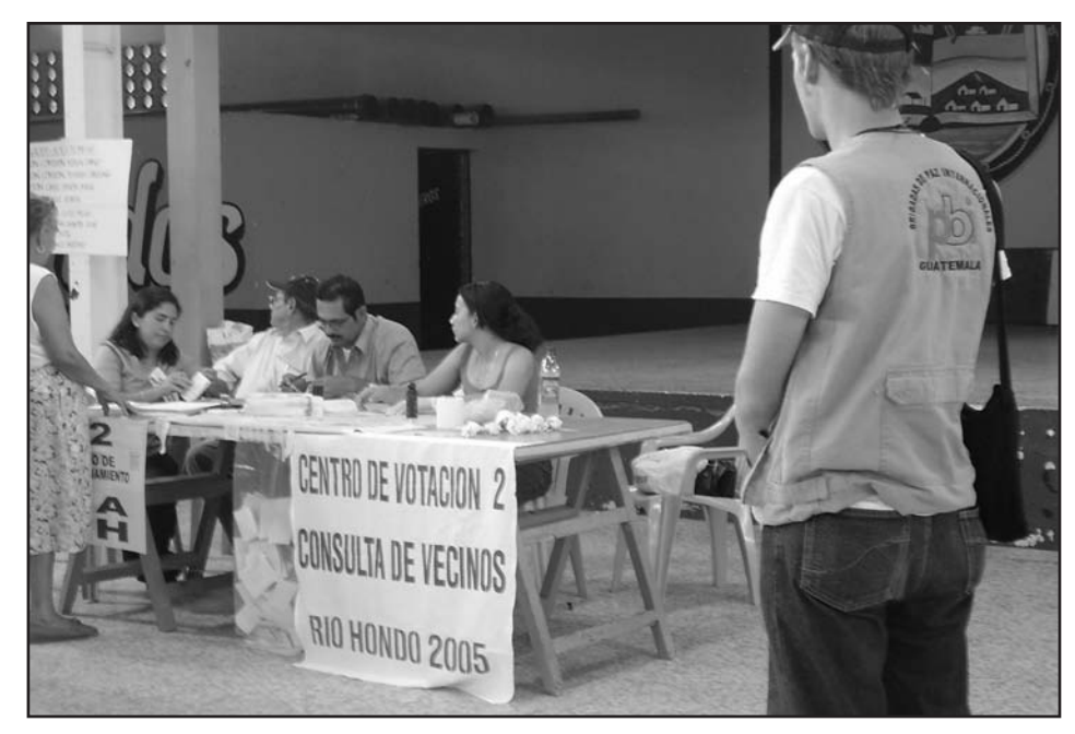
Observing the consultation process in Río Hondo, July 2005.

On June 10th the NB assembly plant, situated in zone 5 of Guatemala City, was closed down and 300 workers were dismissed at a time when the Trade Union of the NB Assembly Plant (SITRA NB) was at the point of signing the final clauses of a Collective Pact between the management and the Union. During the closure, the