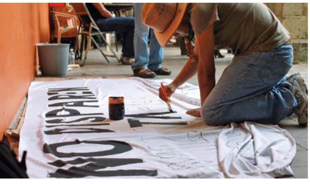
"Don't Shoot" during an action of the Movement for Peace with Justice and Dignity

to the "war against organized crime"6 in its official speech, and has announced a new strategic plan for security,7 according to scholars and civil society, its militarized security policy hasn't changed substantially, failing to decrease rates of violence.8 The Peña Nieto administration owes a debt to defenders and to the thousands of victims left by the former administration. The Mexican state must investigate, prosecute, punish, repair damages and guarantee the right to justice, in order to