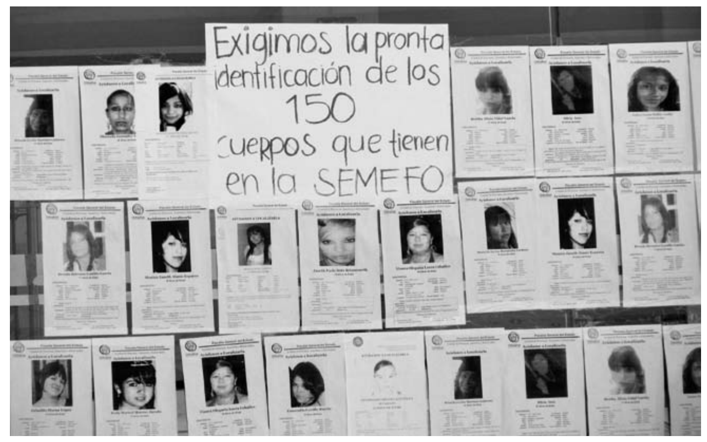
Posters of Disappeared People at the entrance of the Special Prosecutor's Office in the state of Chihuahua

During 2012, PBI México invested many of its resources and energy in an exploratory mission in the country. The activities carried out in this exploratory on one hand represent follow up to the 2011 evaluation, which indicated that PBI Mexico could have a greater impact in new areas, where international attention has, up until now, been limited. On the other hand, the exploratory was carried out in response to an increase in petitions from organizations from states where PBI had not previously had a presence in the field. The exploratory mission was the expression of PBI's effort to adjust to recent changes in the political context of Mexico.