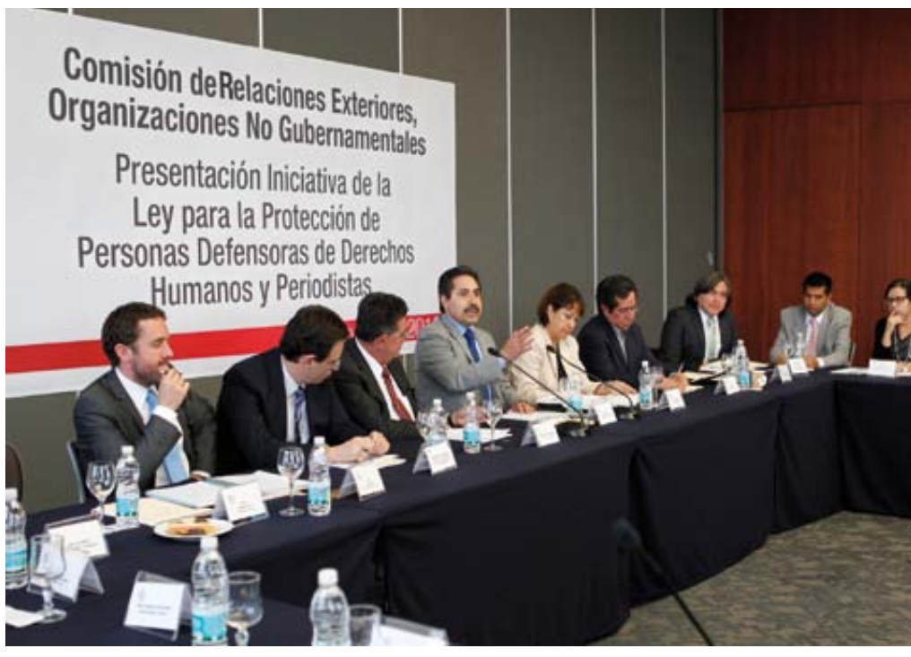
Presentation of the initiative for the Law for the Protection of Human Rights Defenders and Journalists Mexican Senate

The Mexico Project's objective is to respond to civil society petitions and contextual challenges, characterized by widespread violence and conflicts between criminal groups and the Mexican government, which continue to generate an appalling number of assassinations, disappearances and other crimes among the population of Mexico.<sup>1</sup> The use of militarization as a tactic to combat organized crime did not improve security; inversely, the deployment of the army and other public forces led to an alarming increase in human rights abuse, as documented by national and international organizations.<sup>2</sup> This situation directly affects the work of defenders and social activists that continue to face high risk situations in their pursuit of justice and the protection of human