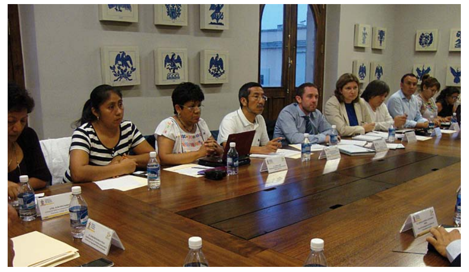
Observatory mission on the situation of human rights defenders in Oaxaca, organised by PBI Mexico and Red TdT

During the visit, which garnered the attention of the media, the Red TdT highlighted that Oaxaca is the state with the largest rate of aggressions perpe-