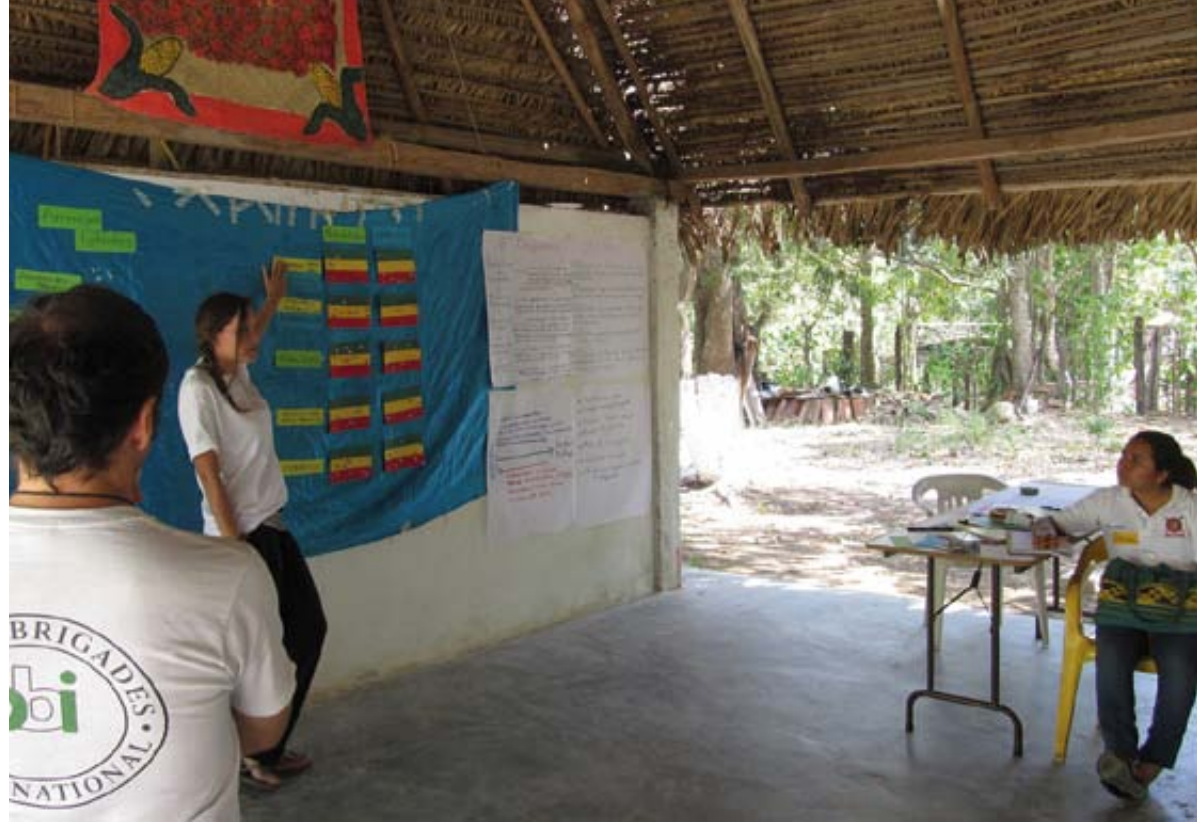
PBI security training in Oaxaca

Trainings and consultancy were initially directed to organisations accompanied by PBI, but the number of petitions coming from other entities or activists has increased in the last few years. Since 2011, PBI has extended protection to other defenders. During 2012, besides consultancy done in the context of accompaniment, PBI also provided training and consultancy to 10 new organisations from three states (Puebla, Coahuila and Oaxaca), plus Mexico City, that were not otherwise accompanied; these organisations' work focuses on different themes relevant in Mexico (freedom of expression, political and edu-