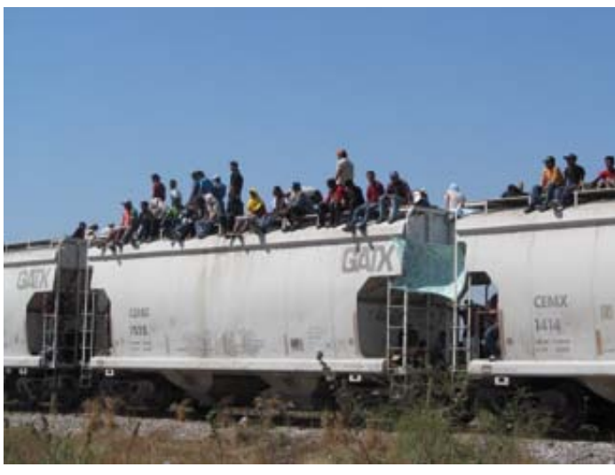
"The Beast" during the route across lstmo of Tehuantepec (Oaxaca)

The same authorities received letters of concern from PBI's support network in various countries. Six embassies in Mexico invited defenders from Oaxaca to speak to their diplomatic corps, and political counsellors from the embassies of Canada and the EU –along with the